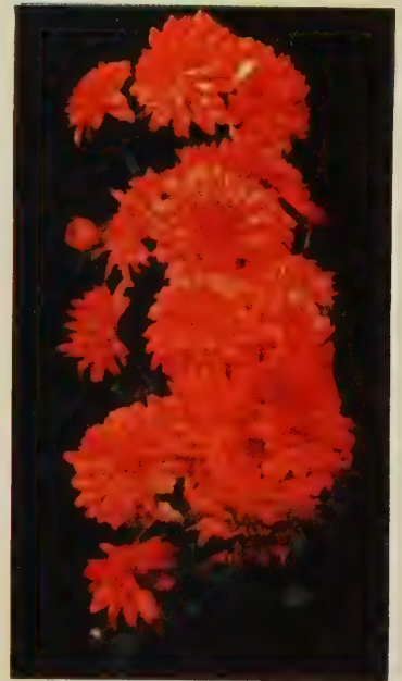
EARLY HARVEST 60c each; 3 for $1.50

6 Color Mounds COLLECTION A selection of six very fine, early-blooming, low-growing kinds. Ideal for foreground or border edging. 6 Sure-to-Bloom Plants $2.65 (1 of each pictured)